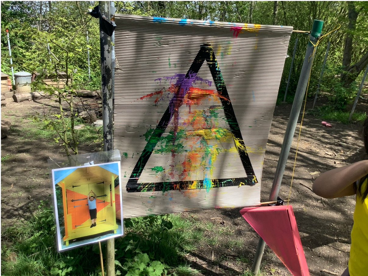
Installation at Whitfield Aspen School, created by a class as part of Connect

Confidance works because it creates good relationships with people. This means that it can adapt to what people need and have a positive impact on everyone, including students, teachers and the whole school community.