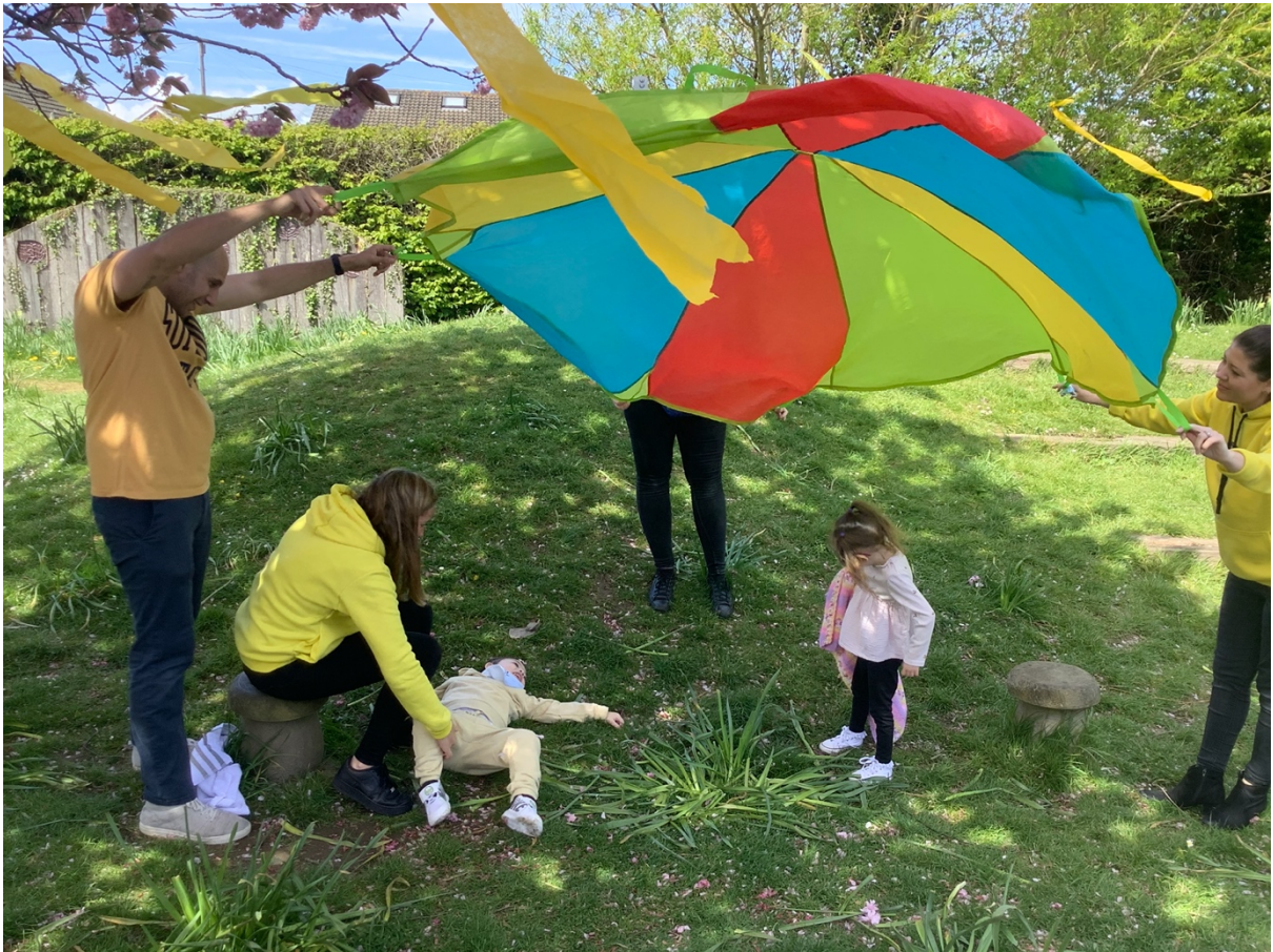
Connect at Whitfield Aspen School, 2021

Connect took place during the Covid-19 pandemic and plans had to be changed a lot in line with public health restrictions.