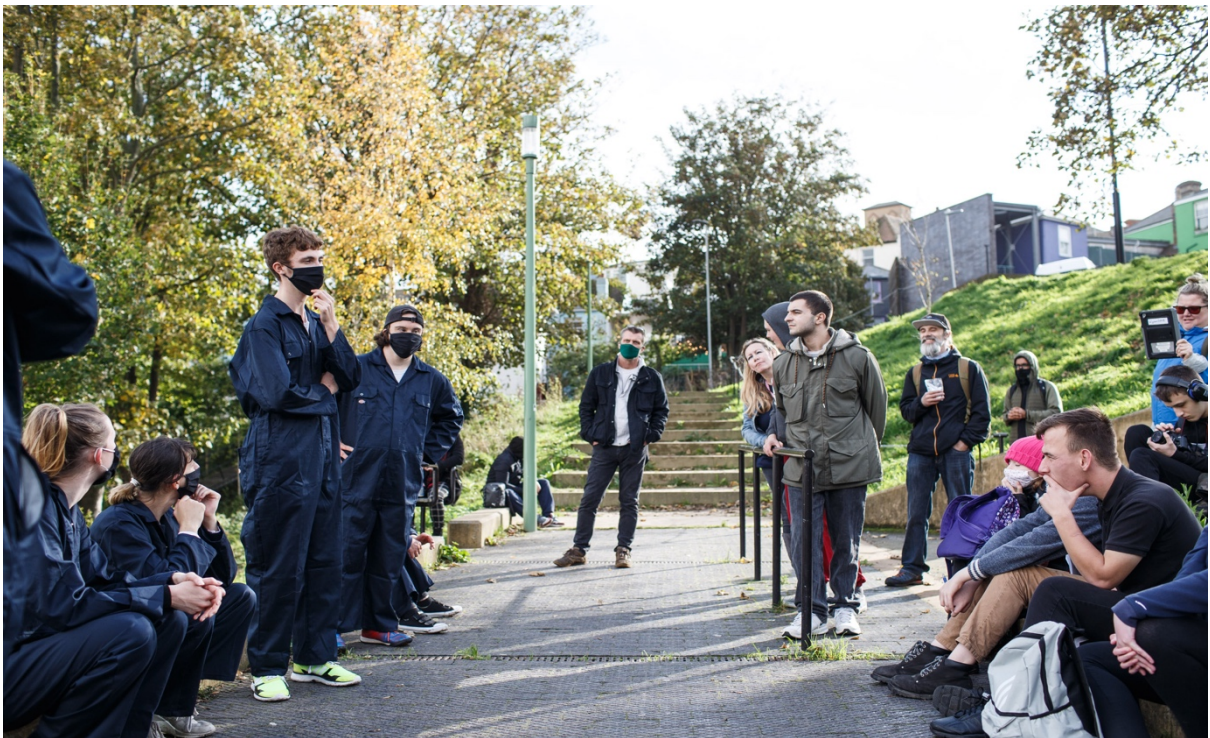
ConfidCo performing at Wyvern School, 2021