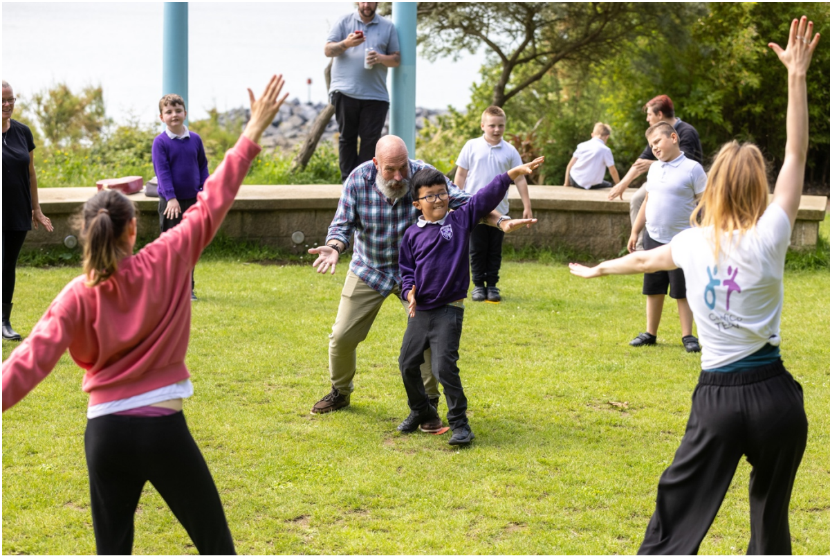
Confidance and Whitfield Aspen School, 2021

This evaluation found that Connect was a successful project that had a positive impact on everyone who took part.