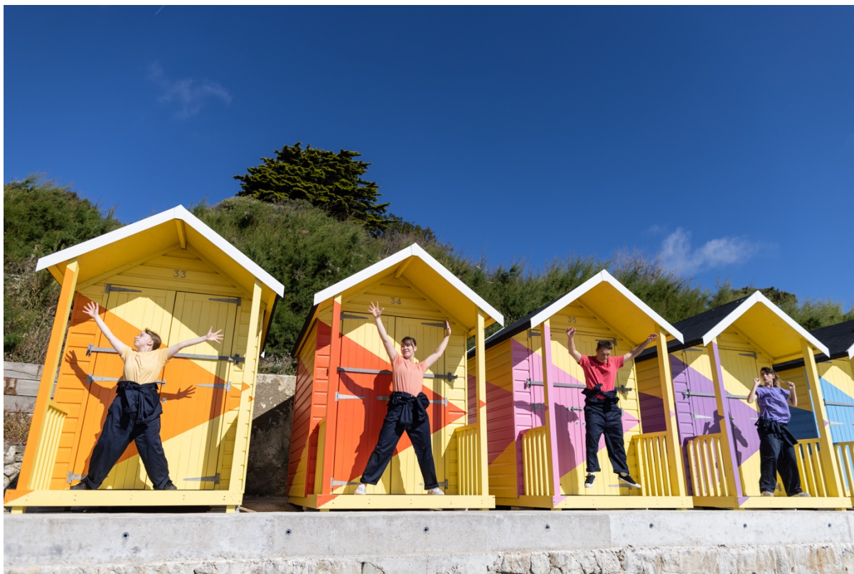
ConfiCo performing in front of Rana Begum's artwork in Folkestone, 2021